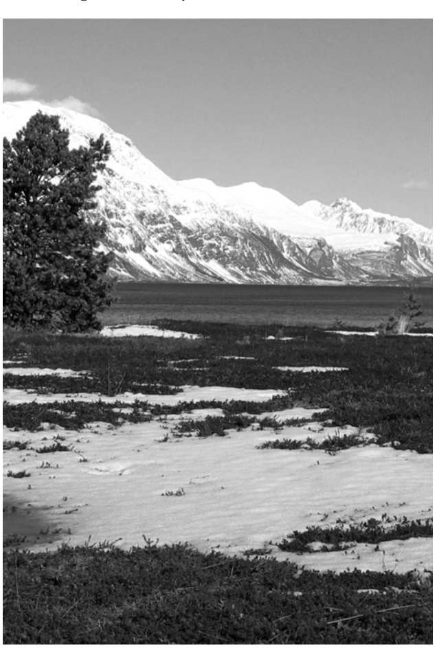
NORWAY • KAISLI SYRJÄNEN

Societies built on fear and greed from hurts connected with scarcity, insecurity, and isolation, cannot function intelligently enough to keep from damaging people and the world. We can usefully oppose and stop particular aspects of this destructive rigid functioning, and need to. We can also stop tolerating the existence of societies based on greed and exploitation.