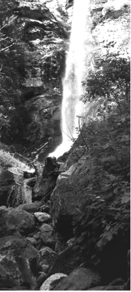
WASHINGTON, USA • LISA KAUFFMAN

For example, there continues to be a drive to find more fossil fuel deposits, and new ways to exploit them, no matter what pollution and damage that their