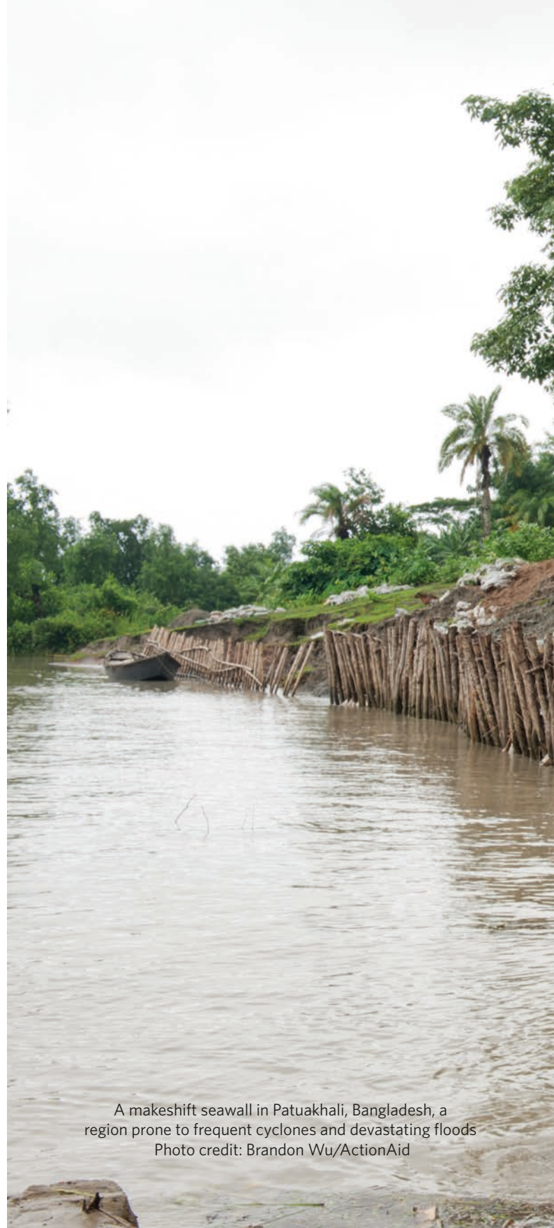
A makeshift seawall in Patuakhali, Bangladesh, a region prone to frequent cyclones and devastating floods