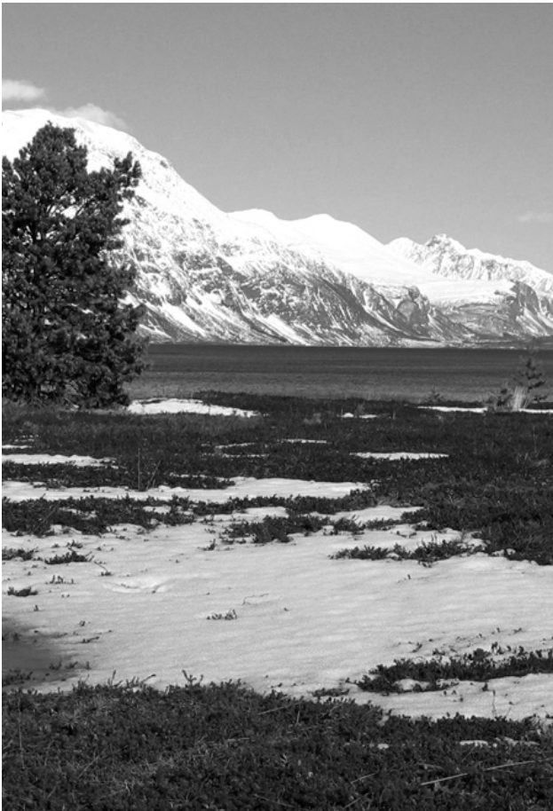
NORWAY • KAIJLI SYRJÄNEN

Societies built on fear and greed from hurts connected with scarcity, insecurity, and isolation, cannot function intelligently enough to keep from damaging people and the world. We can usefully oppose and stop particular aspects of this destructive rigid functioning, and need to. We can also stop tolerating the existence of societies based on greed and exploitation.